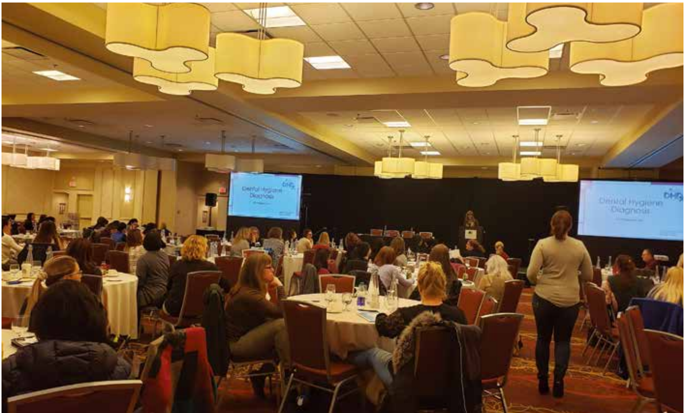
2019 Event "Dental Hygiene Diagnosis"

There were no requests for review during the period from November 1, 2018 to October 31, 2019.