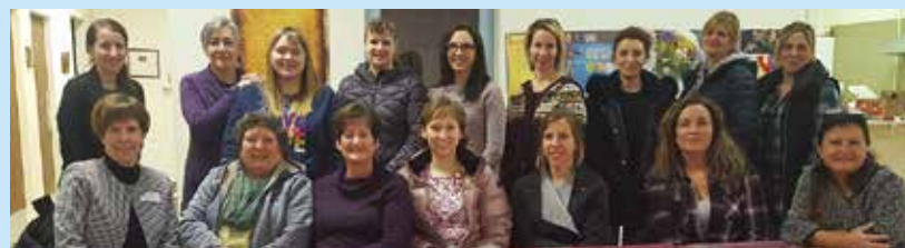
Cold Lake Town Hall Meeting

A well-attended and productive town hall meeting for registrants was held in Cold Lake in November. Plans to visit other remote communities in the warmer months were put on hold with the departure of the Registrar in February.